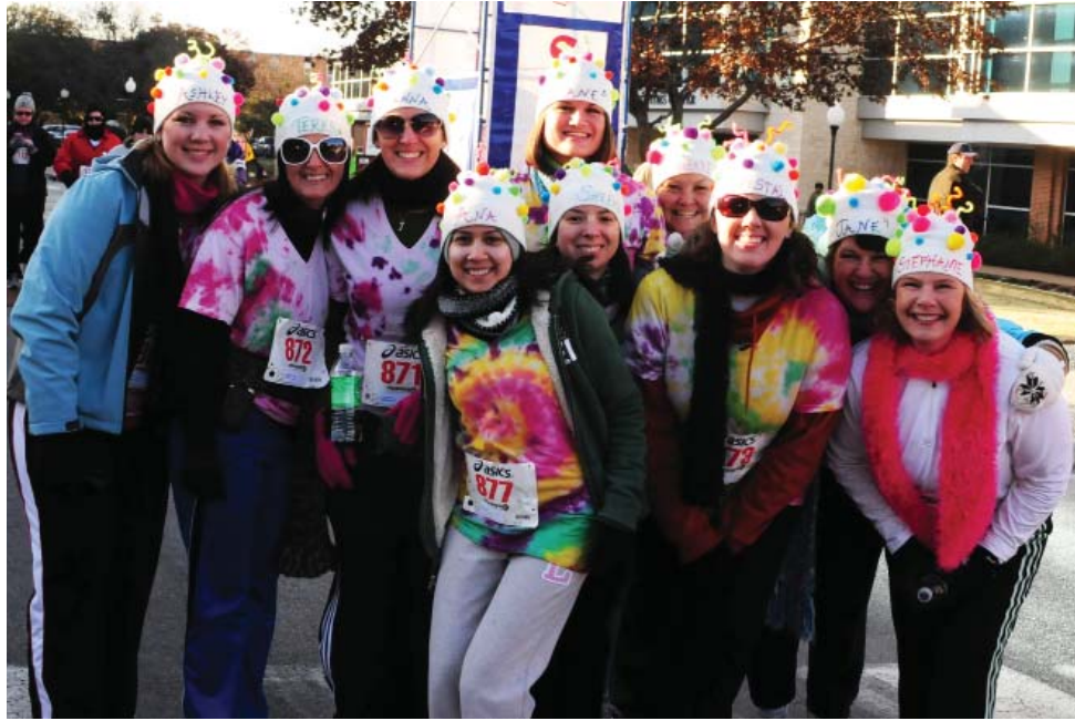
Hundreds gathered in Arlington to run the second annual Jiggle butt run in January. Race proceeds benefitted SafeHaven.