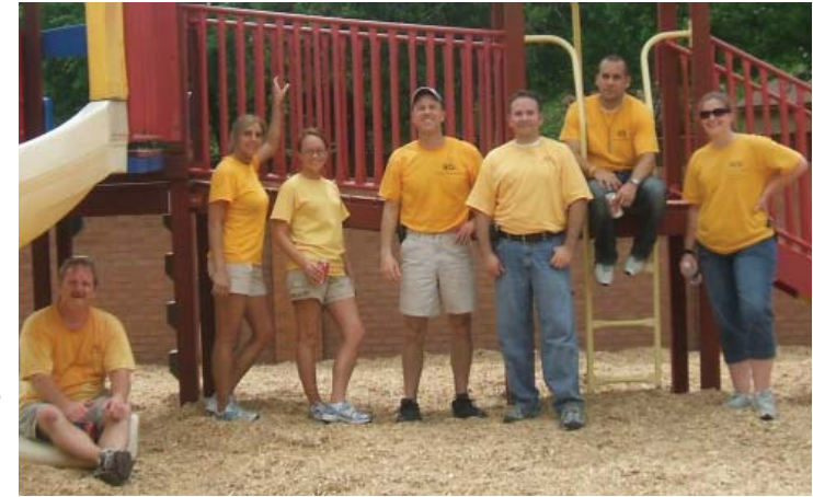
Daimler Truck Financial, winner of the SafeHaven Corporate Partner Award for 2009, recently visited the Arlington shelter and re-mulched the children's playground, built picnic tables and benches for the outdoor areas, purchased and hung new blinds and re-stained the wood portions of the children's playground.