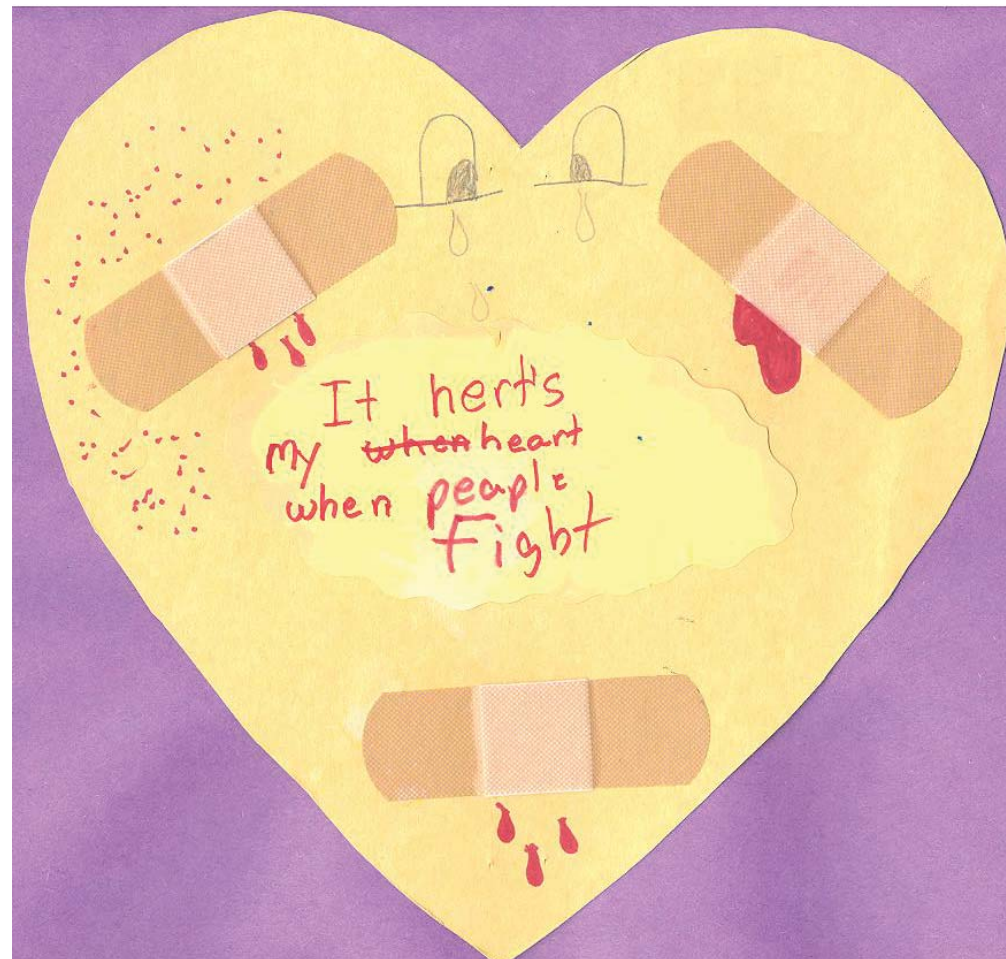
SafeHaven's Children Can Succeed Program uses art and play therapy to counsel child victims of domestic violence. Above is a piece of art one child created to show how violence makes him or her feel.