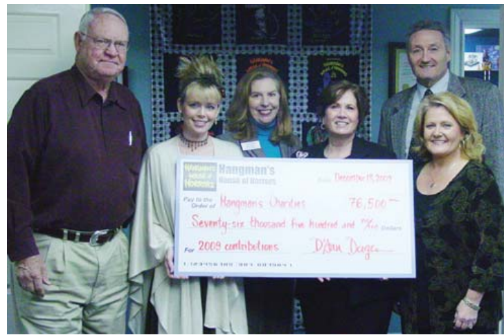
Hangman's House of Horrors raised more than $76,000 for local charities during this year's Halloween celebrations. The organization donated $15,000 of that to SafeHaven. What an amazing gift!